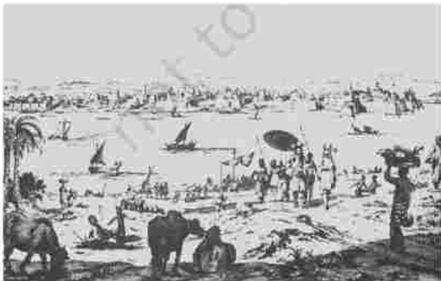
Fig. 18 – A distant view of Surat and its river. All through the seventeenth and early eighteenth centuries, Surat remained the main centre of overseas trade in the western Indian Ocean.

What, then, did India export? The figures again tell a dramatic story. While exports of manufactures declined rapidly, export of raw materials increased equally fast. Between 1612 and 1671, the share of raw cotton exports rose from 5 per cent to 35 per cent. Indigo used for dyeing cloth was another important export for