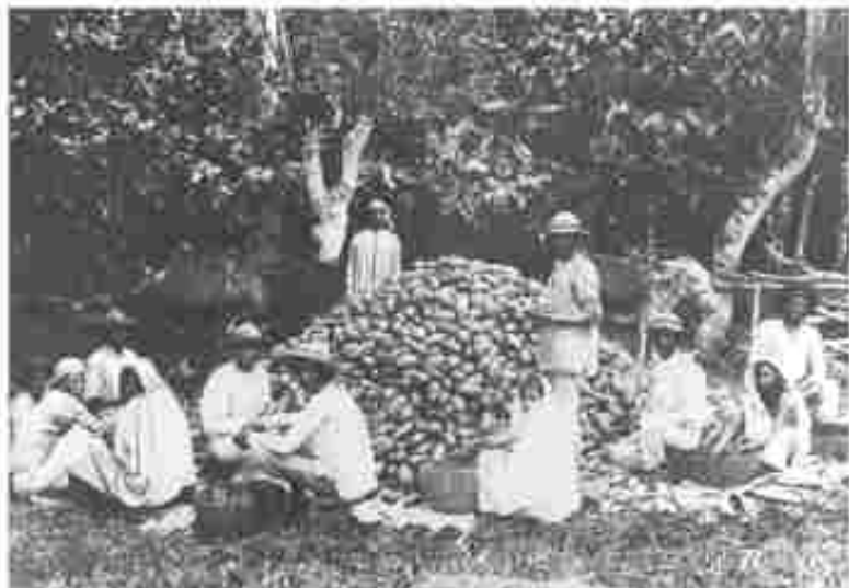
Fig. 14 — Indian indentured labourers in a cocoa plantation in Trinidad, early nineteenth century.

Most indentured workers stayed on after their contracts ended, or returned to their new homes after a short spell in India. Consequently, there are large communities of people of Indian descent in these countries. Have you heard of the Nobel Prize-winning writer