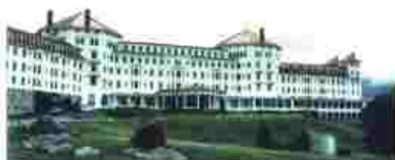
Fig. 26 – Mount Washington Hotel situated in Bretton Woods, US. This is the place where the famous conference was held.

The Bretton Woods system inaugurated an era of unprecedented growth of trade and incomes for the Western industrial nations and Japan. World trade grew annually at over 8 per cent between 1950 and 1970 and incomes at nearly 3 per cent. The growth was also mostly stable, without large fluctuations. For much of this period the unemployment rate, for example, averaged less than 5 per cent in most industrial countries.