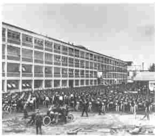
Fig. 21 – T-Model automobiles lined up outside the factory.

Fordist industrial practices soon spread in the US. They were also widely copied in Europe in the 1920s. Mass production lowered costs and prices of engineered goods. Thanks to higher wages, more workers could now afford to purchase durable consumer goods such as cars. Car production in the US rose from 2 million in 1919 to more than 5 million in 1929. Similarly, there was a spurt in the purchase of refrigerators, washing machines, radios, gramophone players, all through a system of 'hire purchase' (i.e., on