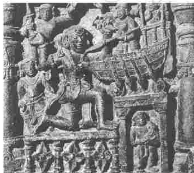
Fig. 1 – Image of a ship on a memorial stone, Goa Museum, tenth century CE. From the ninth century, images of ships appear regularly in memorial stones found in the western coast, indicating the significance of oceanic trade.

All through history, human societies have become steadily more interlinked. From ancient times, travellers, traders, priests and pilgrims travelled vast distances for knowledge, opportunity and spiritual fulfilment, or to escape persecution. They carried goods, money, values, skills, ideas, inventions, and even germs and diseases. As early as 3000 BCE an active coastal trade linked the Indus valley civilisations with present-day West Asia. For more than a millennia, cowrie (the Hindi caudi or seashells, used as a form of currency) from the Maldives found their way to China and East Africa. The long-distance spread of disease-carrying germs may be traced as far back as the seventh century. By the thirteenth century it had become an unmistakable link.