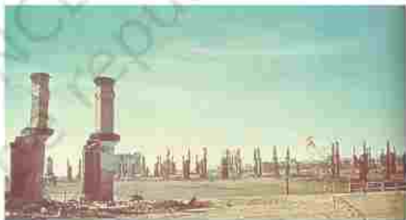
Fig. 25 – Stalingrad in Soviet Russia devastated by the war.