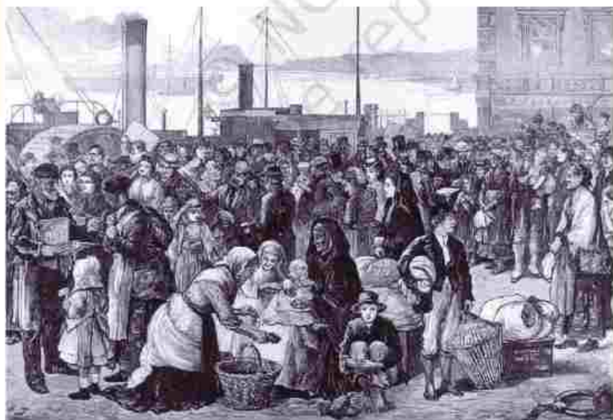
Fig. 7 – Irish emigrants waiting to board the ship, by Michael Fitzgerald, 1874.