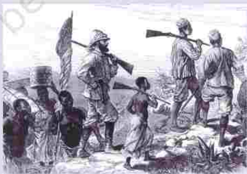
Fig. 11 – Sir Henry Morton Stanley and his retinue in Central Africa. Illustrated London News, 1871.

Stanley was a journalist and explorer sent by the New York Herald to find Livingston, a missionary and explorer who had been in Africa for several years. Like other European and American explorers of the time, Stanley went with arms, mobilised local hunters, warriors and labourers to help him, fought with local tribes, investigated African terrains, and mapped different regions. These explorations helped the conquest of Africa. Geographical explorations were not driven by an innocent search for scientific information. They were directly linked to imperial projects.