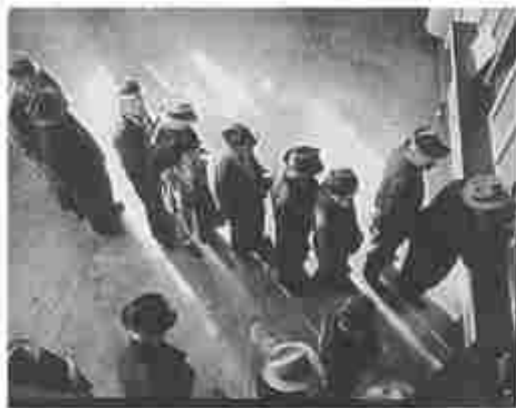
Fig. 23 – People lining up for unemployment benefits, US, photograph by Dorothea Lange, 1938. Courtesy: Library of Congress, Prints and Photographs Division. When an unemployment census showed 10 million people out of work, the local government in many US states began making small allowances to the unemployed. These long queues came to symbolise the poverty and unemployment of the depression years.

In the nineteenth century, as you have seen, colonial India had become an exporter of agricultural goods and importer of manufactures. The depression immediately affected Indian trade. India's exports