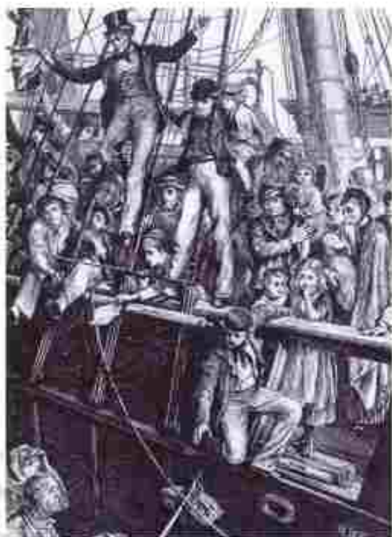
Fig. 6 – Emigrant ship leaving for the US, by M.W. Ridley, 1869.

Nearly 50 million people emigrated from Europe to America and Australia in the nineteenth century. All over the world some 150 million are estimated to have left their homes, crossed oceans and vast distances over land in search of a better future.