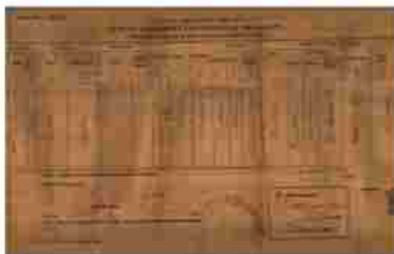
Fig. 16 — A contract form of an indentured labourer.

From the 1900s India's nationalist leaders began opposing the system of indentured labour migration as abusive and cruel. It was abolished in 1921. Yet for a number of decades afterwards, descendants of Indian indentured workers, often thought of as 'coolies', remained an uneasy minority in the Caribbean islands. Some of Naipaul's early novels capture their sense of loss and alienation.