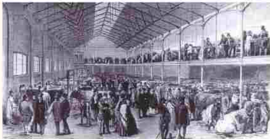
Fig. 8 – The Smithfield Club Cattle Show, Illustrated London News, 1861.

Cattle were traded at fairs, brought by farmers for sale. One of the oldest livestock markets in London was at Smithfield. In the mid-nineteenth century a huge poultry and meat market was established near the railway line connecting Smithfield to all the meat-supplying centres of the country.