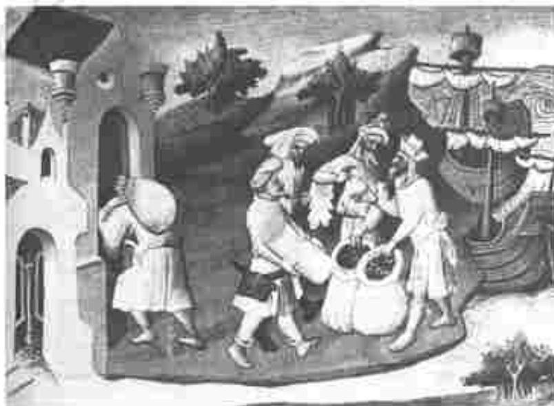
Fig. 3 – Merchants from Venice and the Orient exchanging goods, from Marco Polo, Book of Marvels , fifteenth century.

Many of our common foods such as potatoes, soy, groundnuts, maize, tomatoes, chillies, sweet potatoes, and so on were not known to our ancestors until about five centuries ago. These foods were only introduced in Europe and Asia after Christopher Columbus accidentally discovered the vast continent that would later become known as the Americas.