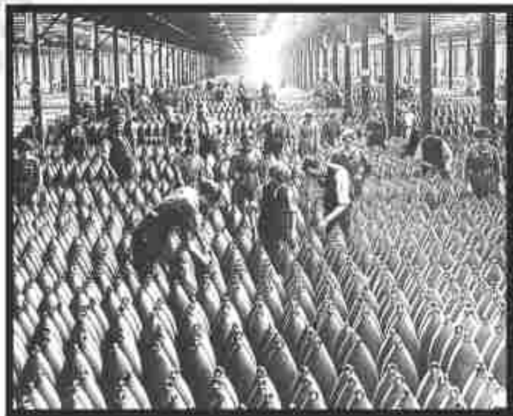
Fig. 20 – Workers in a munition factory during the First World War.

During the war, industries were restructured to produce war-related goods. Entire societies were also reorganised for war – as men went to battle, women stepped in to undertake jobs that earlier only men were expected to do.