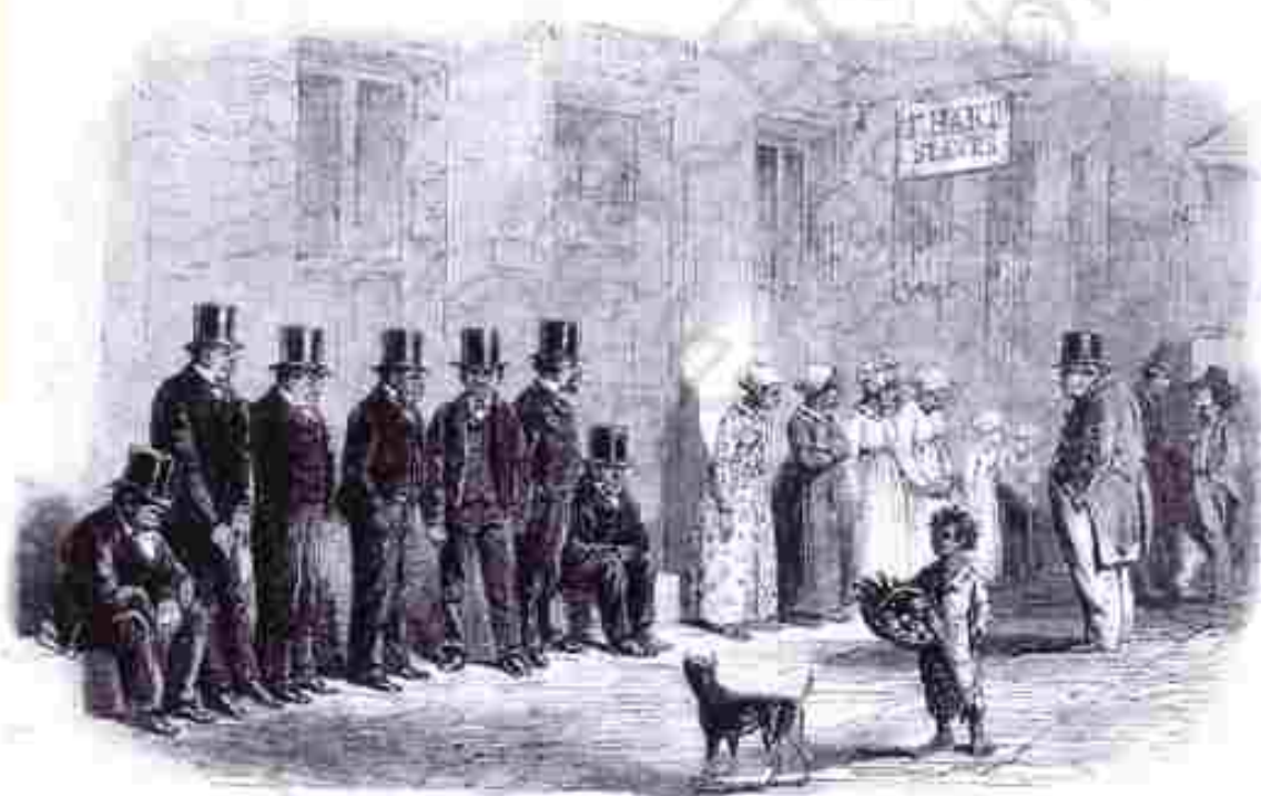
Fig. 5 – Slaves for sale, New Orleans, Illustrated London News, 1851.

Explain what we mean when we say that the world 'shrank' in the 1500s.