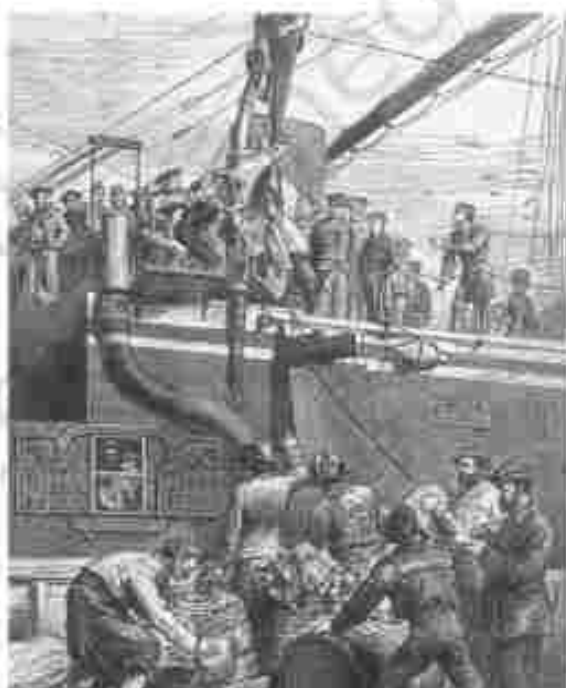
Fig. 9 – Meat being loaded on to the ship, Alexandria, Illustrated London News, 1878. Export of meat was possible only after ships were refrigerated.

Trade flourished and markets expanded in the late nineteenth century. But this was not only a period of expanding trade and increased prosperity. It is important to realise that there was a darker side to this process. In many parts of the world, the expansion of trade and a closer relationship with the world economy also meant a loss of freedoms and livelihoods. Late-nineteenth-century European conquests produced many painful economic, social and ecological changes through which the colonised societies were brought into the world economy.