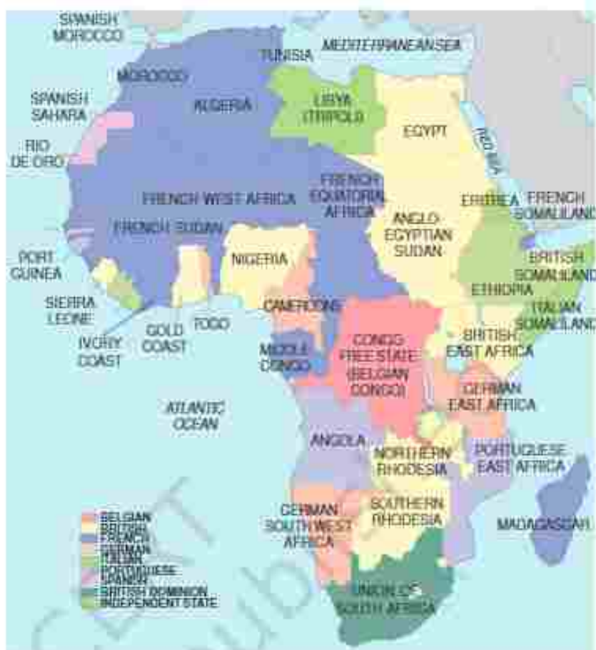
Fig. 10 – Map of colonial Africa at the end of the nineteenth century.

Let us look at one example of the destructive impact of colonialism on the economy and livelihoods of colonised people.