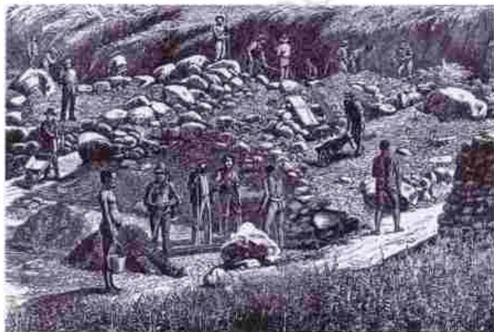
Fig. 13 – Diggers at work in the Transvaal gold fields in South Africa, The Graphic, 1875.

Crossing the Vilge river was the quickest method of transport to the gold fields of Transvaal. After the discovery of gold in Witwatersrand, Europeans rushed to the region despite their fear of disease and death, and the difficulties of the journey. By the 1880s, South Africa contributed over 20 per cent of the world gold production.