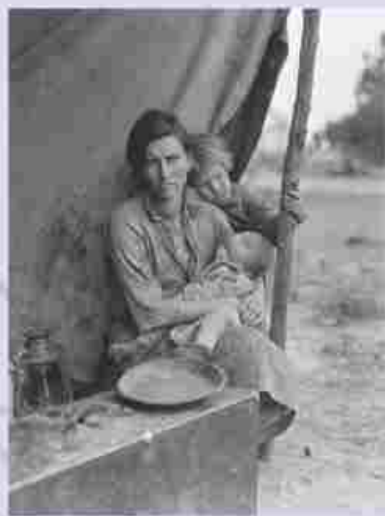
Fig. 22 – Migrant agricultural worker's family, homeless and hungry, during the Great Depression, 1936.

Many years later, Dorothea Lange, the photographer who shot this picture, recollected the moment of her encounter with the hungry mother: