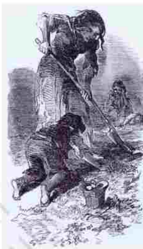
Fig. 4 – The Irish Potato Famine, Illustrated London News, 1849.

The Portuguese and Spanish conquest and colonisation of America was decisively under way by the mid-sixteenth century. European conquest was not just a result of superior firepower. In fact, the most powerful weapon of the Spanish conquerors was not a conventional military weapon at all. It was the germs such as those of smallpox that they carried on their person. Because of their long isolation, America's original inhabitants had no immunity against these diseases that came from Europe. Smallpox in particular proved a deadly killer. Once introduced, it spread deep into the continent, ahead even of any Europeans reaching there. It killed and decimated whole communities, paving the way for conquest.