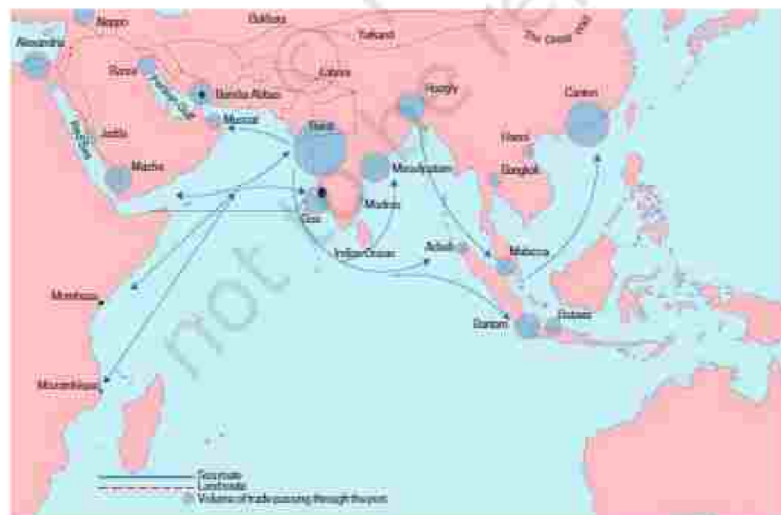
Fig. 19 – The trade routes that linked India to the world at the end of the seventeenth century.

Britain's trade surplus in India also helped pay the so-called 'home charges' that included private remittances home by British officials and traders, interest payments on India's external debt, and pensions of British officials in India.