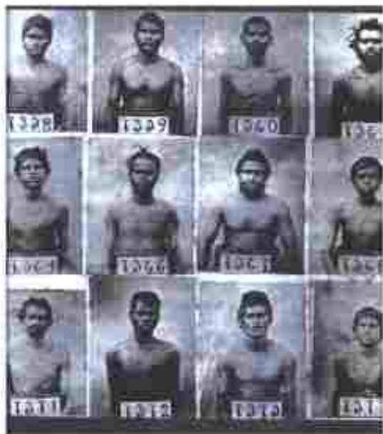
Fig. 15 — Indentured labourers photographed for identification. For the employers, the numbers and not the names mattered.

Discuss the importance of language and popular traditions in the creation of national identity.