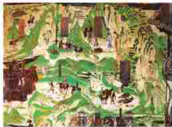
Fig. 2 – Silk route trade as depicted in a Chinese cave painting, eighth century, Cave 217, Mogao Grottoes, Gansu, China.

Trade and cultural exchange always went hand in hand. Early Christian missionaries almost certainly travelled this route to Asia, as did early Muslim preachers a few centuries later. Much before all this, Buddhism emerged from eastern India and spread in several directions through intersecting points on the silk routes.