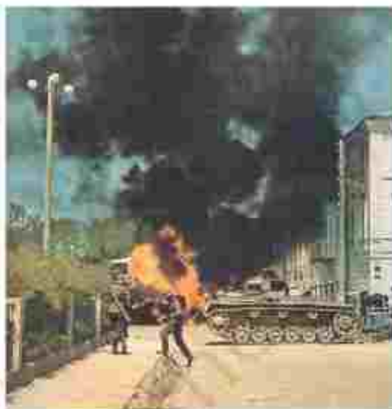
Fig. 24 – German forces attack Russia, July 1941. Hitler's attempt to invade Russia was a turning point in the war.

Two crucial influences shaped post-war reconstruction. The first was the US's emergence as the dominant economic, political and military power in the Western world. The second was the dominance of the Soviet Union. It had made huge sacrifices to defeat Nazi Germany, and transformed itself from a backward agricultural country into a world power during the very years when the capitalist world was trapped in the Great Depression.