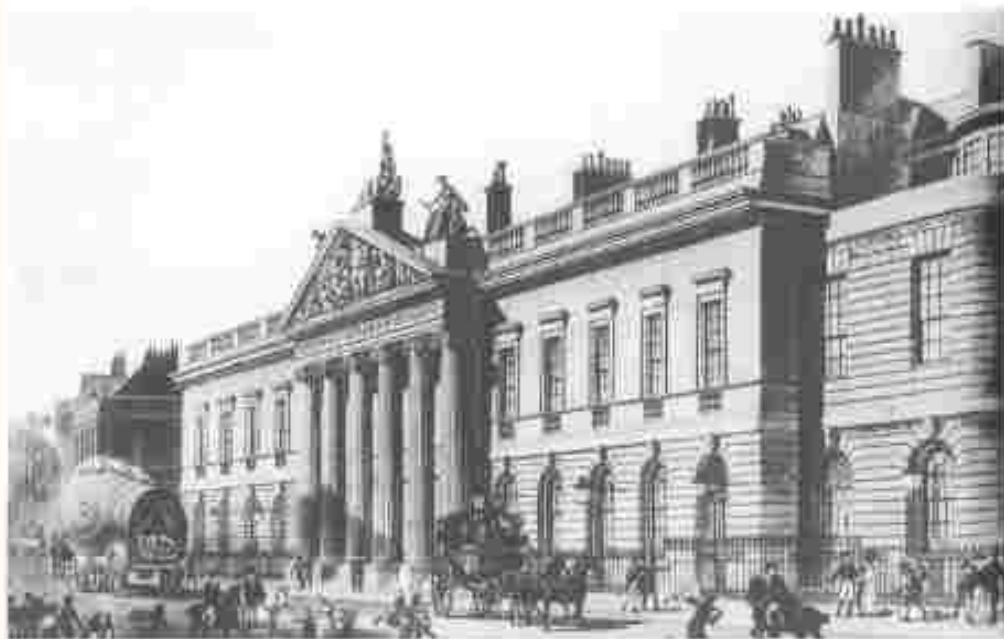
Fig. 17 – East India Company House, London. This was the nerve centre of the worldwide operations of the East India Company.

market by tariff barriers, Indian textiles now faced stiff competition in other international markets. If we look at the figures of exports from India, we see a steady decline of the share of cotton textiles: from some 30 per cent around 1800 to 15 per cent by 1815. By the 1870s this proportion had dropped to below 5 per cent.