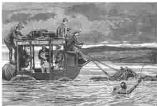
Fig. 12 – Transport to the Transvaal gold mines. The Graphic, 1887.

Employers used many methods to recruit and retain labour. Heavy taxes were imposed which could be paid only by working for wages on plantations and mines. Inheritance laws were changed so that